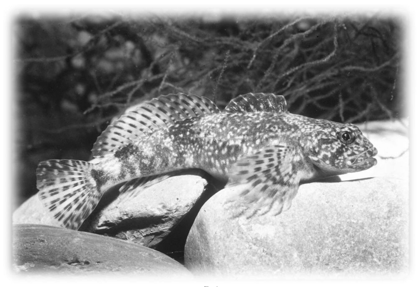
Fig. 3. Slimy sculpin, Cottus cognatus.