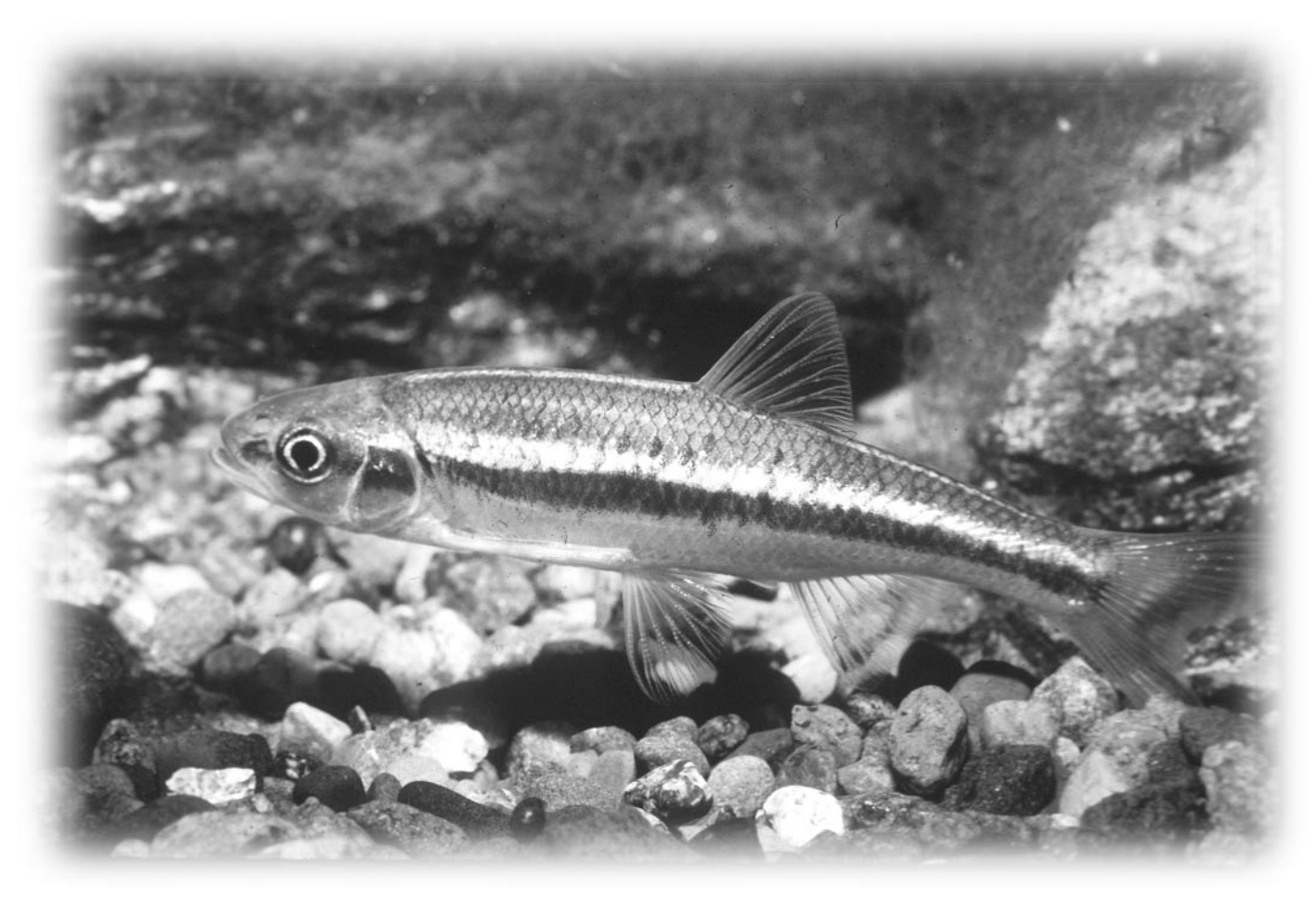
Fig. 2. Rosyside dace, Clinostomus funduloides .

ornamental fish worldwide. Other Asian minnows—most notable among them the goldfish ( Carassius auratus )—represent an important part of the aquarium fish trade. Because of their collective abundance over an extensive range, perhaps their greatest—albeit unseen—importance is as forage for species higher up in the food chain. On the negative side, exotic introductions such as the grass carp ( Ctenopharyngodon idella ) have had a negative impact upon some native ecosystems where they have been used to control vegetation. More than 200 species of minnows are native to North America.