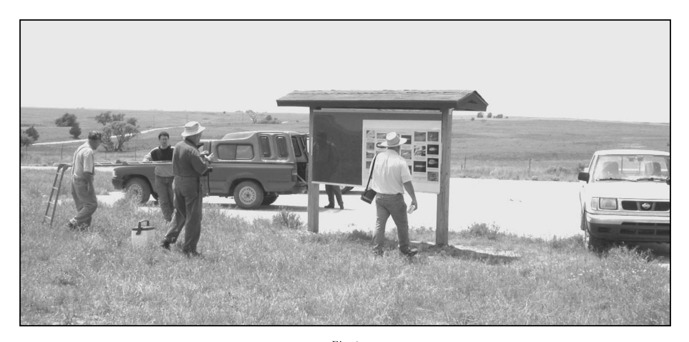
Fig. 6. Members of the Oklahoma Native Plant Society examine the newly erected sign at the SLL dormitory complex.

Red River pupfish, Cyprinodon rubrofluviatilis . American Midland Naturalist 88: 109-130.