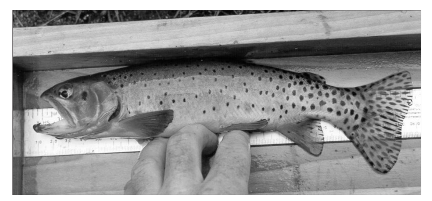
Fig. 2. Greenback cutthroat trout (Oncorhynchus clarkii stomias).

trout (Behnke, 2002). The mechanisms for displacement, however, are not clearly defined.