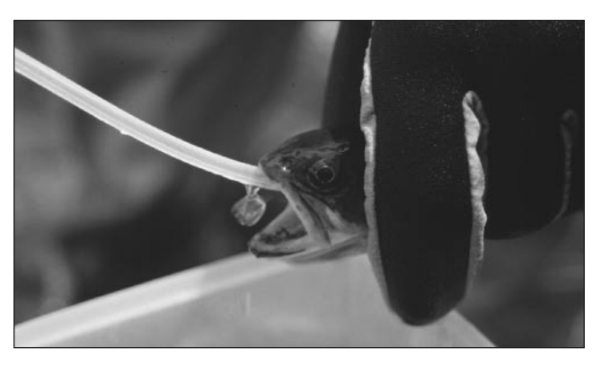
Fig. 4. Obtaining gut contents from a brook trout.

"Well, that is the question," I replied once again.