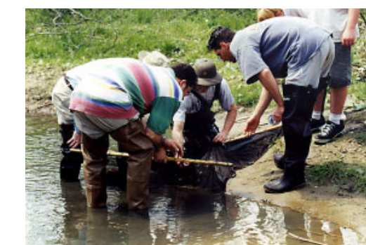
Aquatic life observation in a tributary.