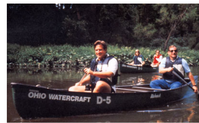
Aquatic life observation in a tributary.