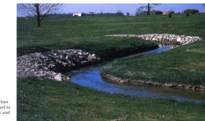
Agricultural activities and urban development have contributed to the loss of streamside forests and increased erosion.