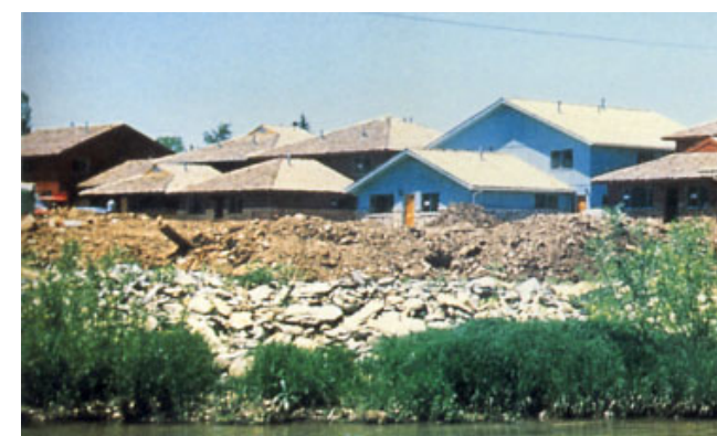
Agricultural activities and urban development have contributed to the loss of streamside forests and increased erosion.

The waterways alongside these forests provide anglers with a wide variety of fish. Inland rivers and streams usually contain large or small-mouth bass, sunfish, catfish and crappie. Riparian forests provide "living classrooms" for the study of nature, especially the life history and behavior of aquatic and terrestrial plants and animals. These forests have a great variety of birds making them favorite sites for birdwatchers.