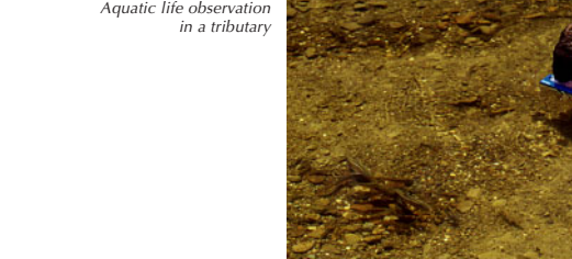
Aquatic life observation in a tributary.